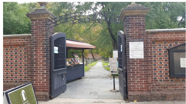
Main Gate Entrance

For my observations, I also focused on how people entered the space through the main gate; these observations strengthened my conclusion that many visitors simply happen upon the space. Most people that I observed entering through the main gate paused at the entrance for several moments before either moving on or continuing inside.