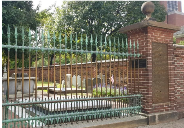
Franklin's Opening in the Fence