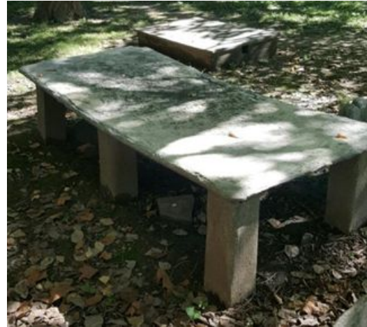
Example of a Tabletop Grave

In contrast to the visitors, the staff was not bound by these supposed restrictions within the space. Because the staff is responsible for the maintenance of the space, they are authorized to move freely through the headstones and touch the monuments in order to perform their jobs. The staff's specialized knowledge of the burial grounds and the surrounding area also differentiates them from visitors. Most visitors to the site are tourists, and are therefore unfamiliar with the history of the burial grounds or the layout of the surrounding area; there is an unequal balance of knowledge, and by extension power, between staff and visitors. However, this unequal balance of power is never acted upon as the staff does not patrol the grounds or reprimand visitors for breaking the implied or stated rules of the space.