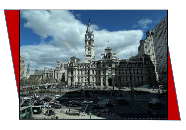
View from the Conference Hall