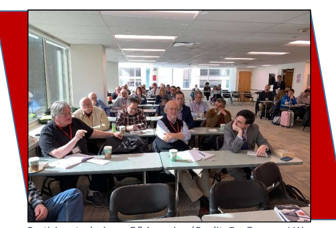
Participants during a Q&A session