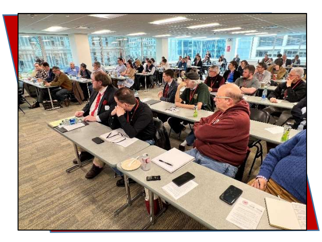
A full audience in the middle of the day