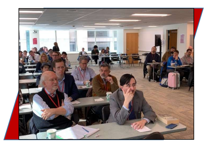
Conference Attendees